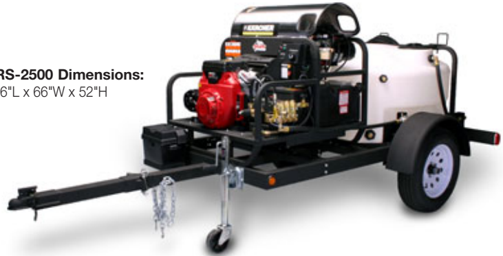
TRS-2500 Dimensions: 136"L x 66"W x 52"H