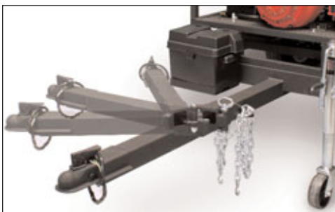
39-inch tongue with swing-away hinge saves on storage space